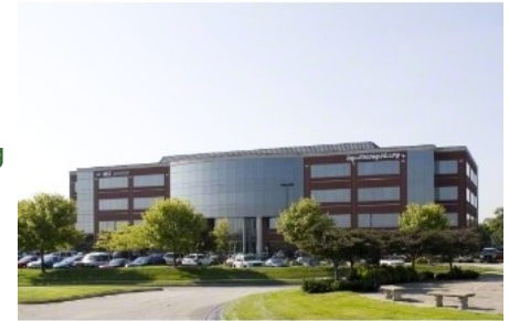
Lake Pointe Center III

8520 Allison Pointe Boulevard, Suite 200 Indianapolis, IN 46250